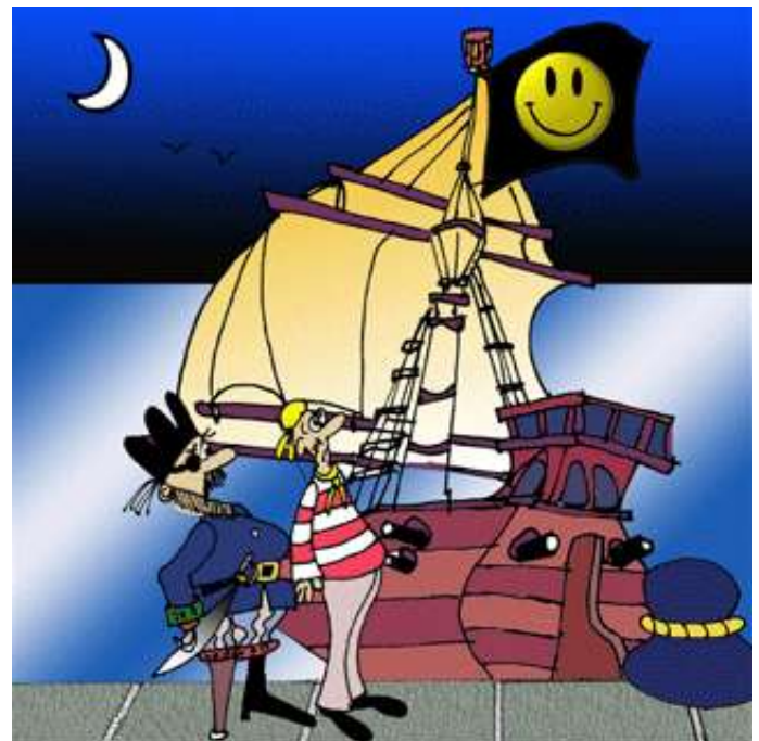
Bring me the sail maker!

http://www.cruiser.co.za/hostmelon500.asp , 16 years living on Watermelon ☞